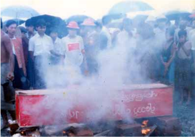
Kyaw Myo Thant's Funeral: Cremation

Name: (U) Kyi Date of Arrest: 1992 Date of Death: 25 September 1994