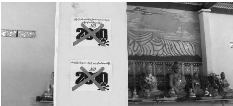
In some areas, villagers demonstrated against the elections and displayed "No Vote" posters, Karen State

“All of our neighbors received the papers required to vote but we didn’t get any. Polling station officials asked me if I could go to the polling station on the Election Day and even though I replied that I doubted I could, I wasn’t given any paper for advance voting. Without the paper, I couldn’t go to the polling station, couldn’t get a ballot and couldn’t vote. So, I lost my right to vote for the first