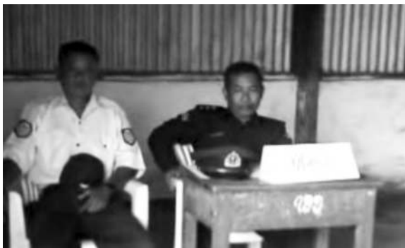
Local Authorities told residents to vote for the USDP, Mon State

Day. Problems with and misuse of voter lists observed during advance votes also continued on the day of the elections. In Rangoon Division, Tanyin Township, some voters went to the polling station to vote but they did not have voting tokens so were not allowed to vote. They brought ID with them but were still not allowed to vote. The Chief of the polling station in Kamano village, Mon State did not allow villagers to vote saying that their names were not on the eligible voters lists, even though villagers had IDs. In Mong We and Mong Pu villages in Namkham township, Northern Shan State, a resident stated that a USDP organizer kept 500 ballots in case USDP needed them. The same organizer illegally forced children to vote for him and made some people to cast duplicate votes on his behalf. 60 At polling-station No. 2 in Aung Metta Ward, Shan State, a candidate gave 7500 kyat to 150 people to vote for him; and on Election Day more people voted than were on the voter lists—over 150 more than the actual 4068 eligible voters. 61