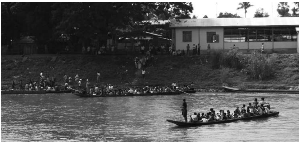
Villagers fleeing the fighting after the Election Day - 8 November 2010