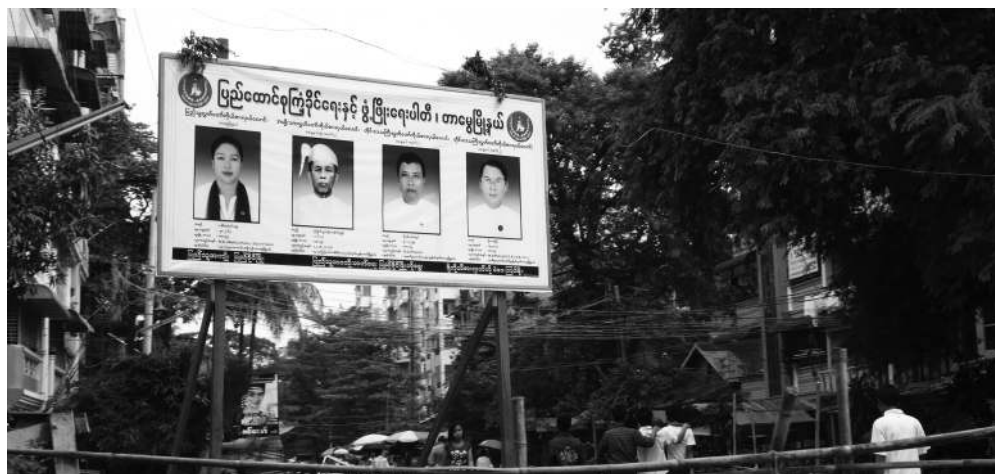
USDP campaign poster in Yangon. During the campaigning period, opposition parties were not allowed to campaign freely. The election law restricted their rights to campaign and freely distribute campaign materials, such as leaflets and posters